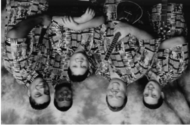
Voted Best Band by Honolulu Star-Bulletin/MidWeek's Hawai'i's Best poll, Kapena will be a Nā Mele guest artist.