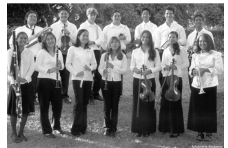
2004 Pacific Music Institute Jackie Chan Charitable Foundation scholarship recipients

renowned actor and philanthropist, Jackie Chan, enabled students to share in a memorable week of music, fellowship and outstanding performances. ♪